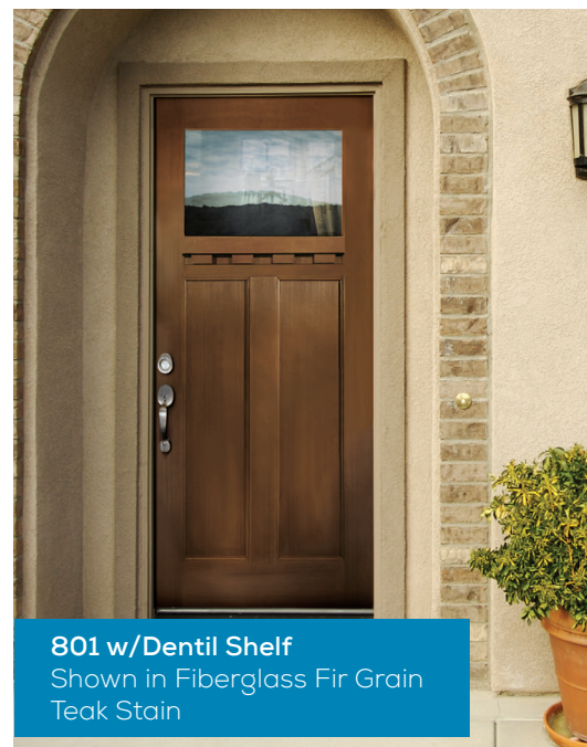
801 w/Dentil Shelf Shown in Fiberglass Fir Grain Teak Stain