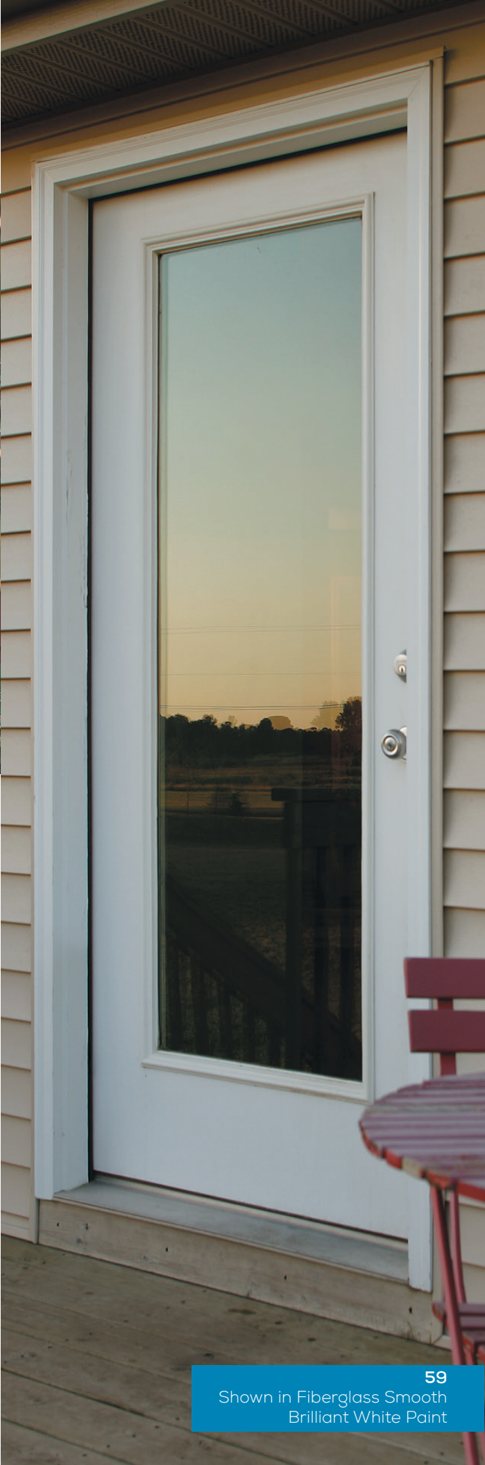
59 Shown in Fiberglass Smooth Brilliant White Paint