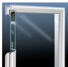
One Lite, No Grid