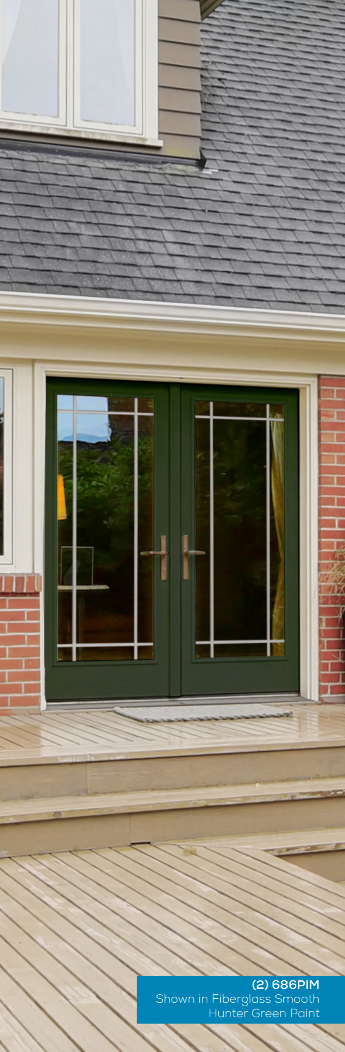
(2) 686PIM Shown in Fiberglass Smooth Hunter Green Paint