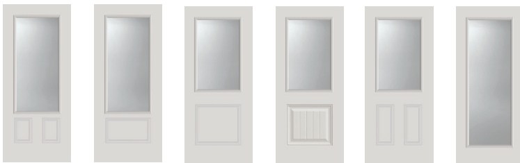
607 22"x48" 608 22"x48" 682 22"x36" 683 22"x36" 684 22"x36" 686 22"x64"

See page 15 for more information on the Zeel frame.