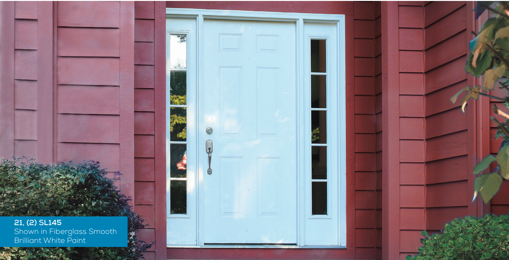
21, (2) SL145 Shown in Fiberglass Smooth Brilliant White Paint

THE TIMELESS CLASSIC COLLECTION OFFERS A LARGE VARIETY OF DESIGNS AND STYLES TO CHOOSE FROM, ALLOWING FOR A COMPLETELY CUSTOMIZED SPACE.