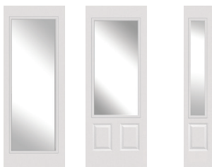
59 22"x80" 147 22"x64" SL147 7"x64"