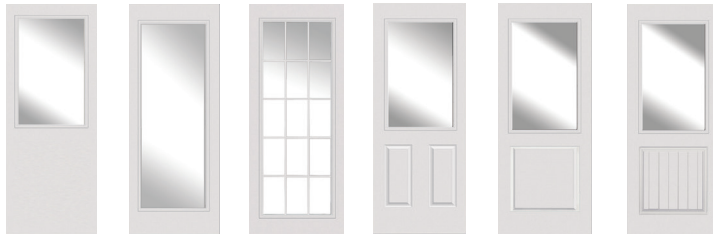
4 22"x36" 59 ^ 22"x64" 61 ^ 22"x64" 122 22"x36" 682 22"x36" 683 22"x36"