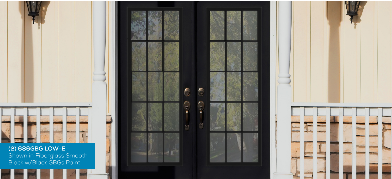
(2) 686GBG LOW-E Shown in Fiberglass Smooth Black w/Black GBGs Paint

GRILLES ARE THERMALLY-SEALED BETWEEN PANES OF CLEAR GLASS FOR A SMOOTH, EASY-TO-CLEAN SURFACE.