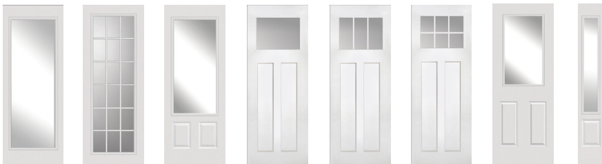
59 22"x80" 61 22"x80" 147 22"x64" 801* 24"x21" 803* 24"x21" 806* 24"x21" 906 22"x48" SL147 7"x64"