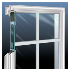
External Standard Grille