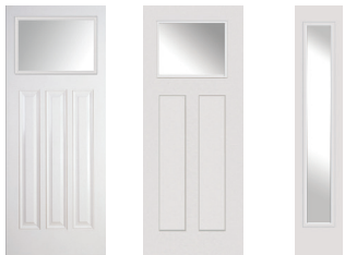
814* 25"x15.25" 866* 22"x15.25" SL140L 7"x64"