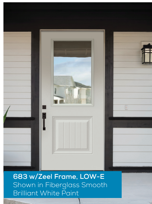
683 w/Zeel Frame, LOW-E Shown in Fiberglass Smooth Brilliant White Paint